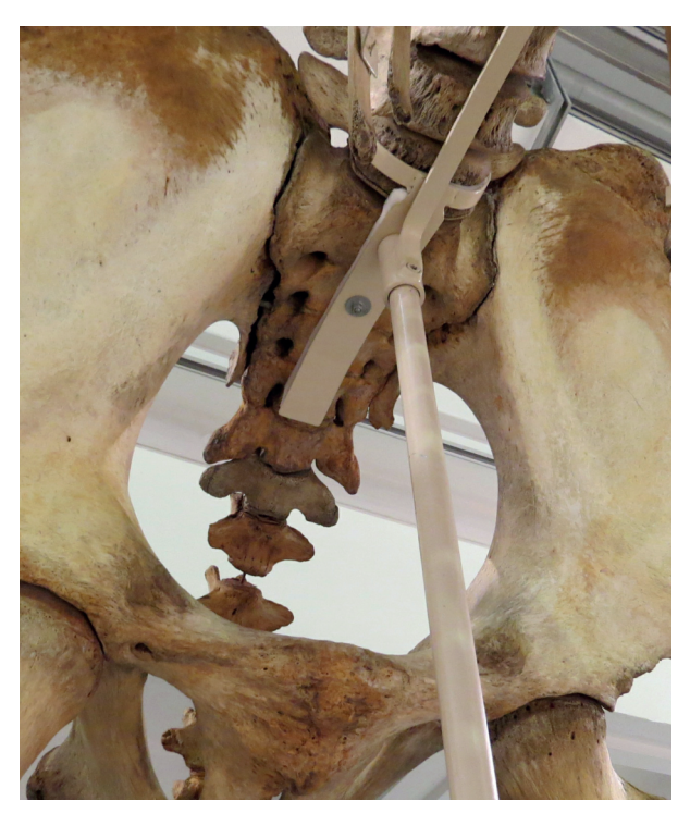
Figure 9. The steel support for pelvic region: the vertical rod on the underside inserted into the top of the rear upright support; and the upper surfaces of the metal bracket are lined with white inert Plastazote foam under the bones.

Some of the small pieces of original metalwork were very difficult to remove. The bracket on the underside of the mandible was very rusty and needed to be removed for cleaning. The bolts securing the bracket could not be undone, even after WD40 had been carefully applied to the metalwork a few times. Therefore, a small 'pen'-sized blowtorch was used to heat and expand the rusty metal bracket and un-seize it from the bolts, which could then be unscrewed and