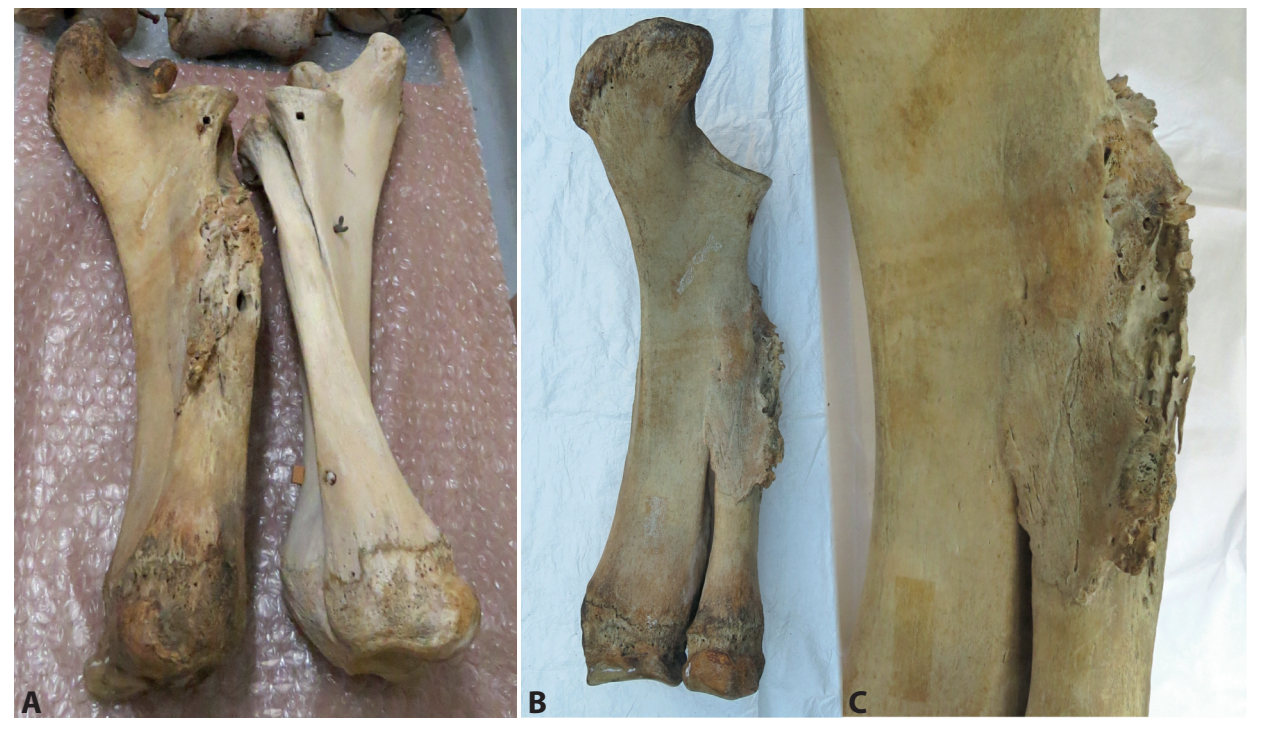
Figure 2. A. The radius and ulna of both of the forelimbs of UMZC.H.4611, showing the pathologically deformed left radius and ulna to the left of the image clearly different to the right radius and ulna on the right of the image; B. the fused left radius and ulna, showing the area of deformed bone; C. a close-up of the diseased area of the left ulna.

The skeleton was dirty from being in storage for 50 years, most recently laying uncovered on open racking. Many bone surfaces were sticky with residues of natural oil, and therefore dust and dirt had adhered to these areas, turning them black over time.