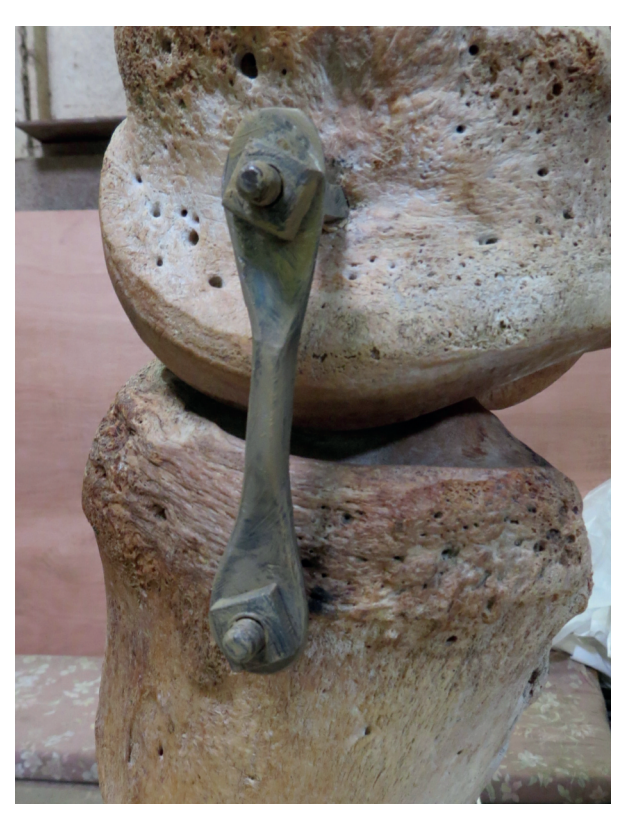
Figure 10. One of the five brackets made on the forge to hold the lower limb bones in articulation with the upper limb bones.