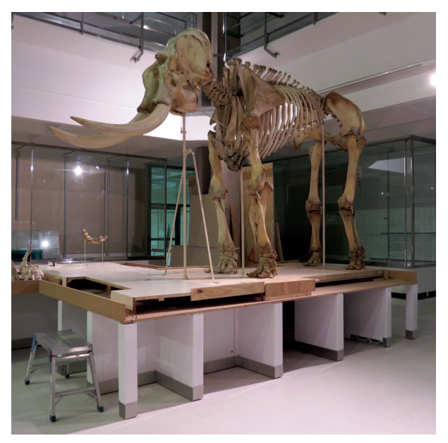
Figure 12. The Asian elephant skeleton (UMZC.H.4611 installed on the high plinth, in the gallery still undergoing refurbishment.

was taken off the display plinth and put back on to the floor, and the ribcage was manoeuvred into position using the two stackers to lift either end of the metalwork. Once the ribcage was secured to the upright supports, the stackers were lowered and used to pick up the wooden base at either end. The wooden base, with the metal supports and ribcage in place, was then raised just above the display plinth and carefully slid into position. All the limb bones were mounted to provide stability to the skeleton before the skull was mounted. To undertake this, surplus wooden crates were covered with Plastazote foam and carefully secured to the stacker platform to make up the height required to get the heavy skull into position. The skull was lifted manually onto the crates on the stacker, and was secured in place temporarily with straps. It was lifted into position and secured on its supporting mount with its original metal hook. Once the skull was secure, the mandible, tusks, and tail were secured in place (Figure 12). The murderous 'Yatiantota Tusker', the "notorious and proscribed rogue" once more dominated the museum.