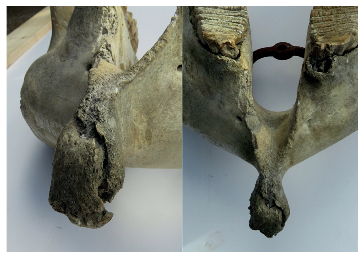
Figure 3. The pathologically deformed symphysis of the mandible of UMZC.H.4611.