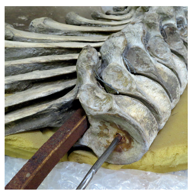
Figure 6. The rusty T-shaped vertebral bar with some of the vertebrae still attached. The thin vertebral rod has been cleaned in an attempt to remove it from the vertebral centra.

Three steel tubes (22 mm internal diameter) were cut to fit i) under the pelvis, ii) between the front legs, and iii) underneath the skull. Each of these was a different height. A section of threaded steel bar (22 mm diameter) was inserted into each of the lower sections of these tubes, protruding by several inches, and was MIG (Metal Inert Gas) welded into place at the end of the tube. A steel 'floor plate' was then welded to the base of each tube to form a collar that would sit on the top of the wooden plinth (Figure 8), with four holes in the horizontal surface so that it could be screwed to the top of the plinth. The threaded bar in the lower end of each tube inserted into a hole drilled through the plinth under the pelvis, pectoral girdle, and skull, in line with the vertebral bar. On the underside of the plinth, these threaded bars inserted through a large, flat steel bracket, designed to reduce the ability of the upright poles to lean sideways. The threaded bar was secured on the other side of this bracket with nuts and spring