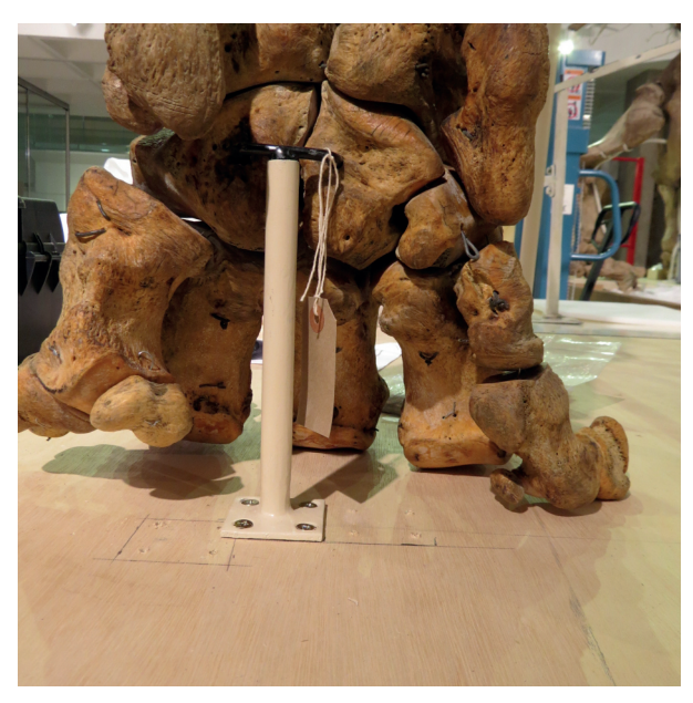
Figure 11. One of the four supports made for the feet: a steel tube welded to a base plate with screw holes, so it can be secured to the wooden base.

the anterior-most pieces were not too curled, and this enabled most of the sternum bones to be re-attached with the appropriate pieces of cartilage in place, using thin steel wire running through the old holes.