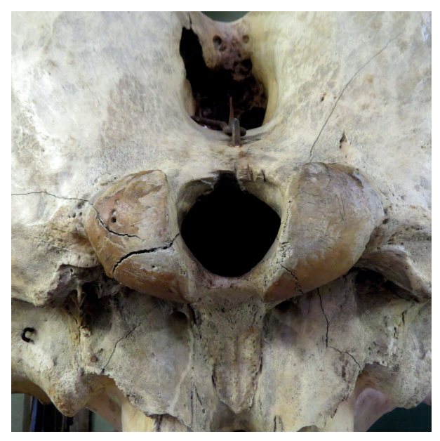
Figure 7. The rear of the elephant skull (UMZC.H.4611) showing substantial cracks around the occipital condyles that have left the skull weak and vulnerable to further damage.

Five of the eight small brackets that hold the lower limb bones to the upper limb bones were missing, and had to be made using a forge, anvil, hammers, and angle grinder (Figure 10). Some of the threaded