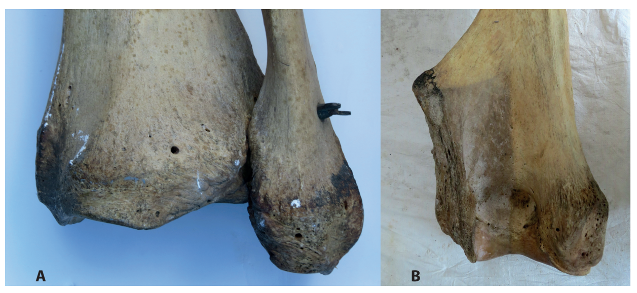
Figure 5. Examples of how dirty the bones of UMZC.H.4611 were before cleaning A. Paint and chalk marks etc on very dirty limb bones. B. A humerus mostly cleaned but the lower left section still dirty.

Whilst dry methods of cleaning bone (such as smoke sponges and 'groom sticks' made of natural rubber and air) are less invasive than wet methods, they may not clean a specimen as effectively, especially if the bone surfaces are rough, like those of an elephant bone. There is a small element of risk to the process: even though the area cleaned is 'rinsed' with deionised water a couple of times immediately after applying the detergent, there is no guarantee that the detergent will be entirely removed. Also, multiple applications of water over a period of time can damage molecular bonds within bone and ultimately exacerbate deterioration. However, a wet cleaning