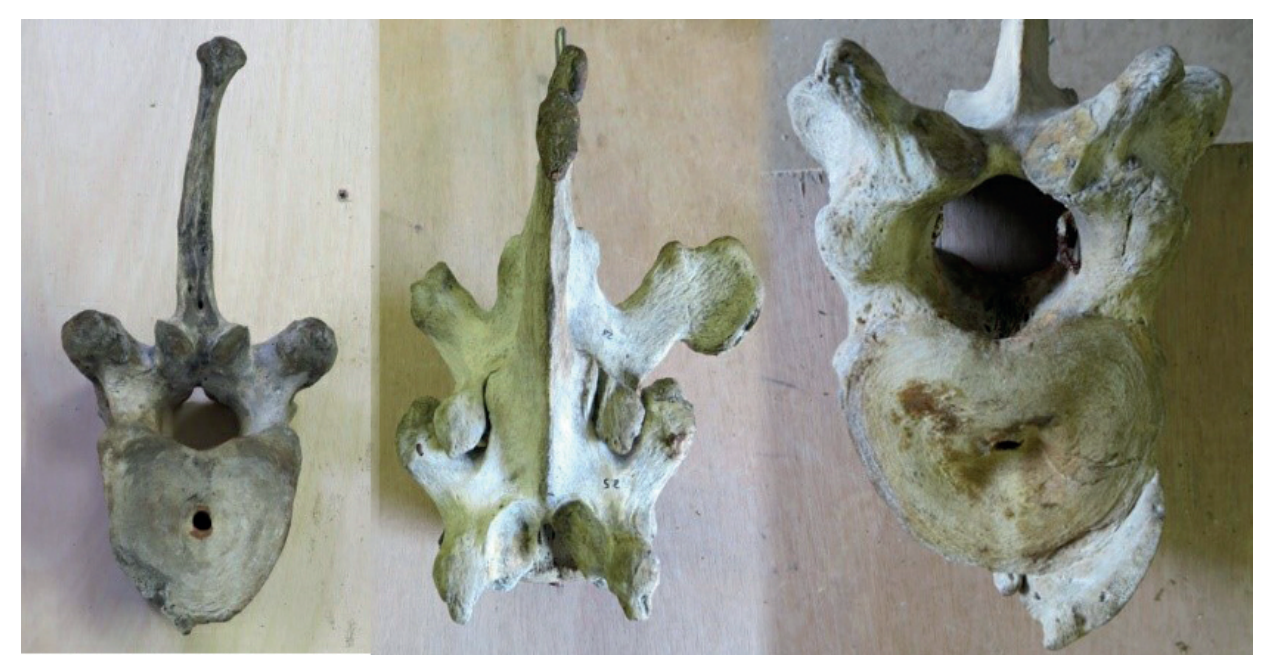
Figure 4. Pathologically deformed vertebrae of the Asian elephant skeleton (UMZC.H.4611): two asymmetrical vertebrae and on the far right a vertebra with a bony overgrowth ventral to the centrum.