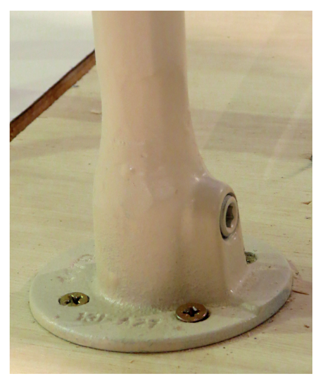
Figure 8. A steel floor plate welded to the bottom of one of the upright steel tubular supports, within which a 22mm diameter threaded bar is welded. This bar runs through the wooden base and is secured underneath with nuts and spring washers.

bars that had been inserted into the ends of the limb bones for attachment to the brackets were missing, and some were present but bent. Therefore, some had to be bent back into position and others replaced.