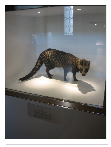
Fig 3. The recently extinct Thylacine.