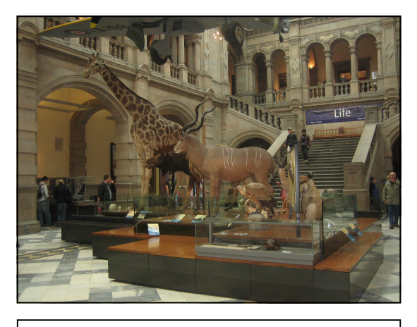
Fig 5. Large natural history centre pieces throughout the galleries.

All in all the 2008 NatSCA conference was an engaging and very enjoyable event. And how could it not be? - interesting people, interested people, good speakers, passionate hosts and, importantly, wonderful venues.