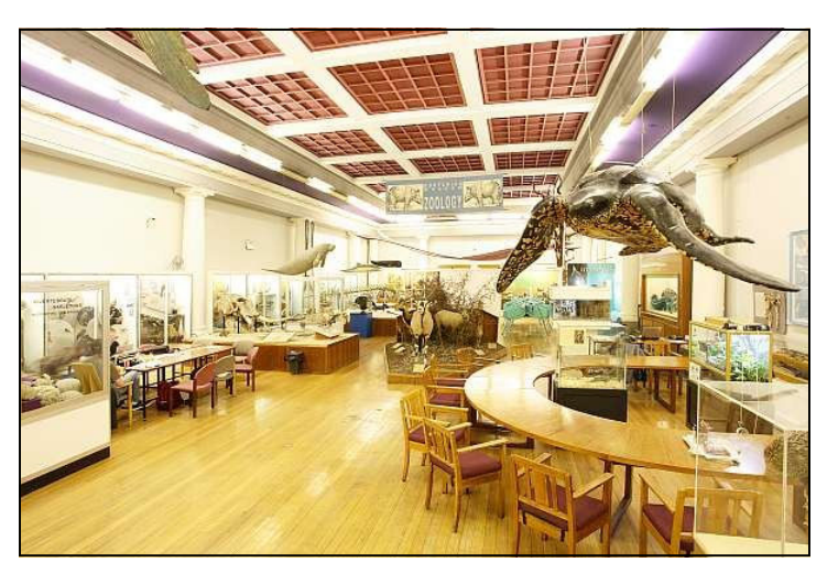
Fig 1. Inside the Zoology Museum at the University of Glasgow.

A recent addition to the gallery has been the insect displays. A model centipede helpfully uses its sections as an excuse to show off parts of the entomology collection. Specimens