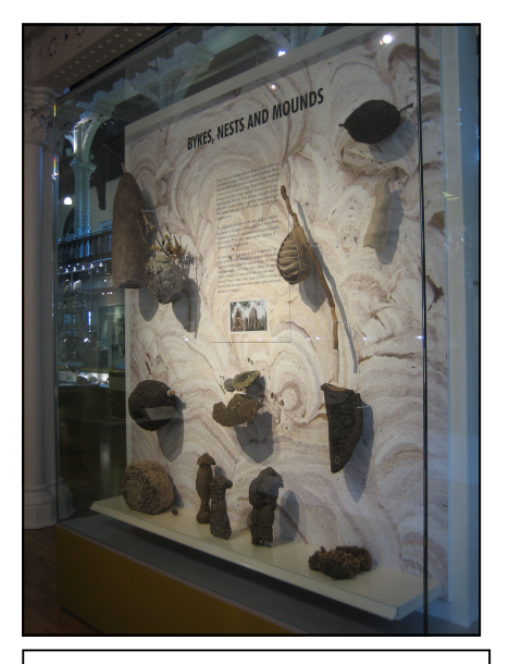
Fig 3. One of the displays at the Huntarian.

The Anatomy Museum is open to the public by appointment only but it was full of people when we arrived (and not because we had arrived!). Students and visitors regularly visit the balconied room for study and literally out of morbid curiosity. Not for the faint hearted, this extraordinary collection includes William Hunter's famous plaster and lead casts of the gravid uterus along with a spectacular array of human and animal parts, diseases and foetuses. It was a treat to be admitted – may it never be changed or 'updated'.