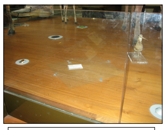
Fig 5. Glass screen to protect specimens from touching.

Kelvingrove's other great design choice was to start with the story rather than the object. This meant plenty of natural history mixed in with other disciplines. Shark jaws lie alongside shark-tooth swords and the flight of the spitfire is discussed alongside gulls and butterflies.