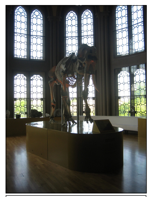
Fig 2. Dick Hendry's elephant skeleton displayed proudly in the centre of the entrance hall.

There appeared to be a good deal of respect given to the natural science collections at the university by the displays at the Hunterian (Fig 3.). Whole cases were dedicated to just one or two natural history specimens - their story was not lost in a case full of other objects. The oversize mineral and entomology drawers were inventive and the Thylacine was listed as the top 'must see item' of the displays (Fig 4.).