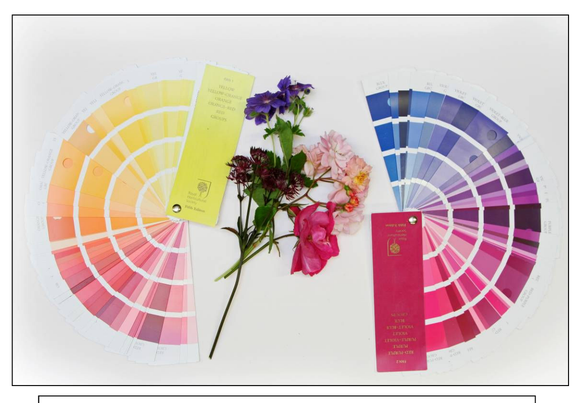
Fig. 1. Horticultural Colour Chart (1939) & RHS Colour Chart, fifth edition (2007) ©RHS Herbarium.

Colour is an important criterion in the description and identification of cultivated plant varieties (cultivars). In fact it is frequently the only distinguishing feature between one cultivar and another; it is therefore a significant diagnostic character. The RHS Colour Chart is a tool that horticulturalists can use to describe colour and it is, for horticulturalists, the standard reference for colour identifications. As J.H. Wanscher wrote in 1953, 'In horticulture there is a natural need for exact, but also simple colour descriptions'.<sup>1</sup> RHS staff, mainly in the Botany and Trials departments, use it for descriptions of plants, for example those that have been given RHS awards from RHS trials and RHS specialist plant committees, in particular those awarded the (Award of Garden Merit) AGM, plants widely available to the general public.