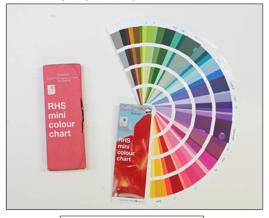
Fig.3. RHS Mini Colour Chart (2005) © RHS Herbarium.

The RHS Mini Colour Chart was published in 2005. (Fig. 3) It comprises one fan of sixty leaves, a total of two hundred and forty of the most used colours from the RHSCC selected by RHS Botany staff. It is also considerably cheaper, costing £25, than the full colour chart which may be purchased for £170. This mini colour chart was published in conjunction with the Flower Council of Holland, (an organisation which promotes the sale of cut flowers, houseplants and annual garden plants on behalf of Dutch wholesalers and breeders), with colours 'specifically chosen for use by the flower trade'.<sup>24</sup>