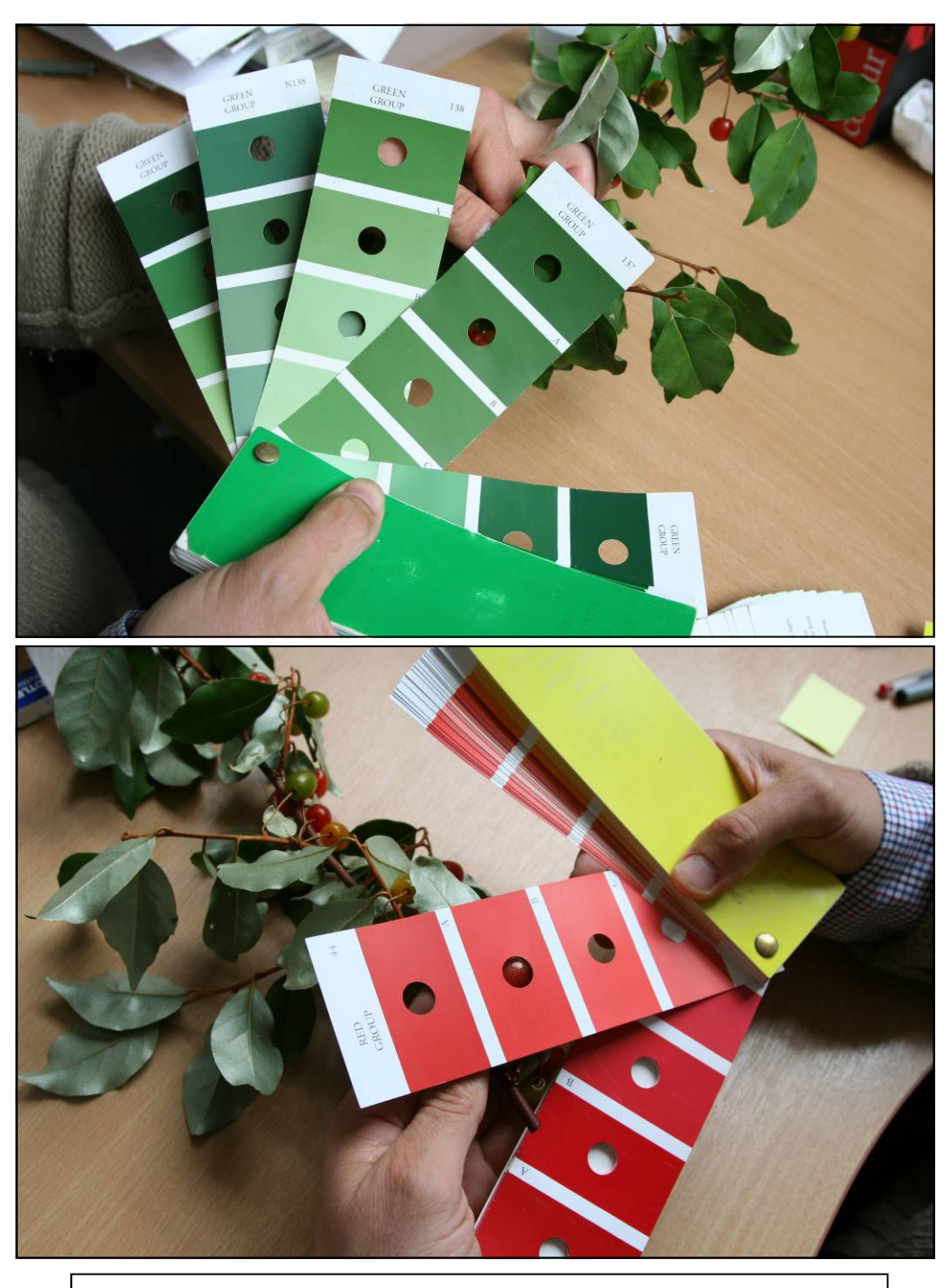
Fig. 6. Using the RHS Colour Chart to describe Eleagnus multiflora.

It is quite exhausting colour charting plants so do not attempt too many at once or you will become overwhelmed. Colour fatigue soon sets in.