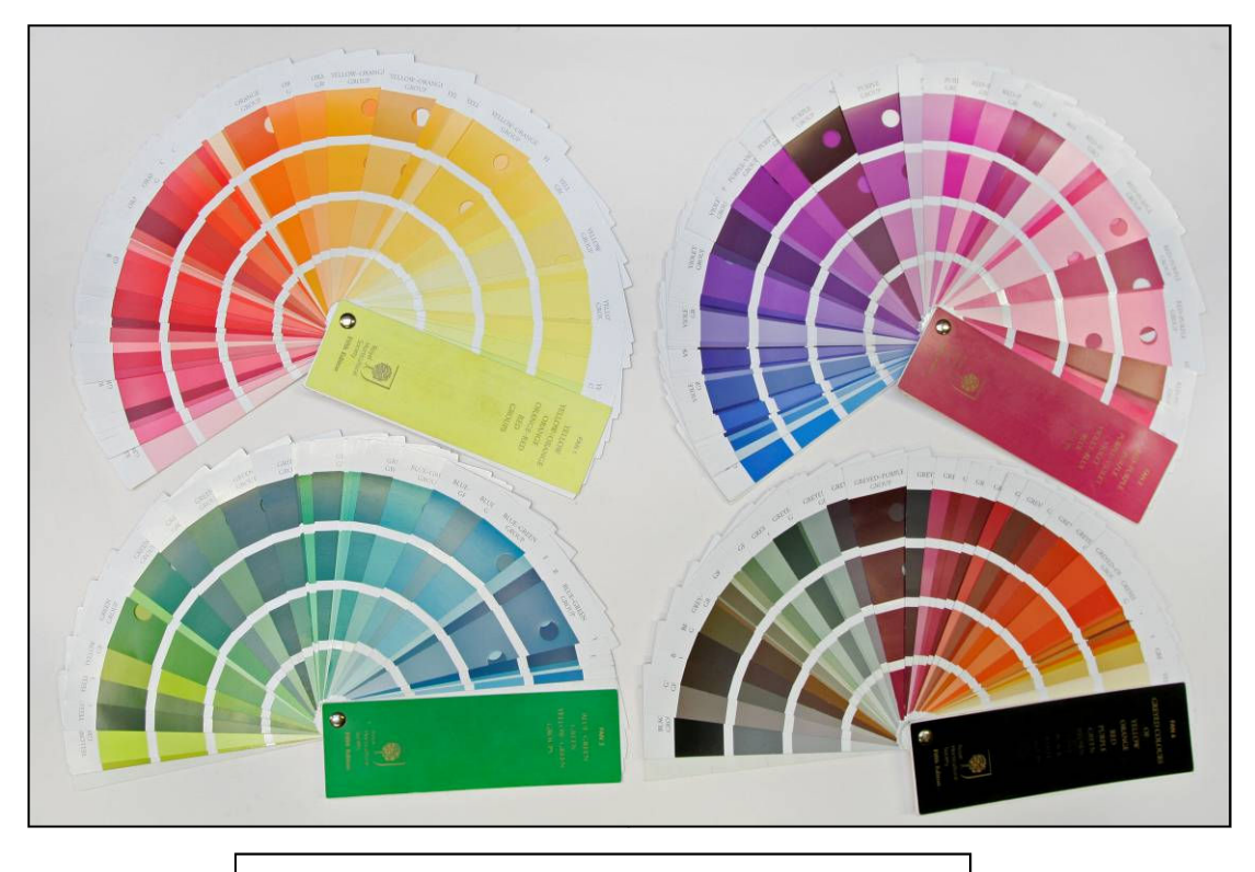
Fig. 4. RHS Colour Chart, fifth edition (2007) © RHS Herbarium.

The 2007 edition, being the fifth, (there was a fourth edition published in 2001) has twelve new colours and a total of eight hundred and ninety-two colours.