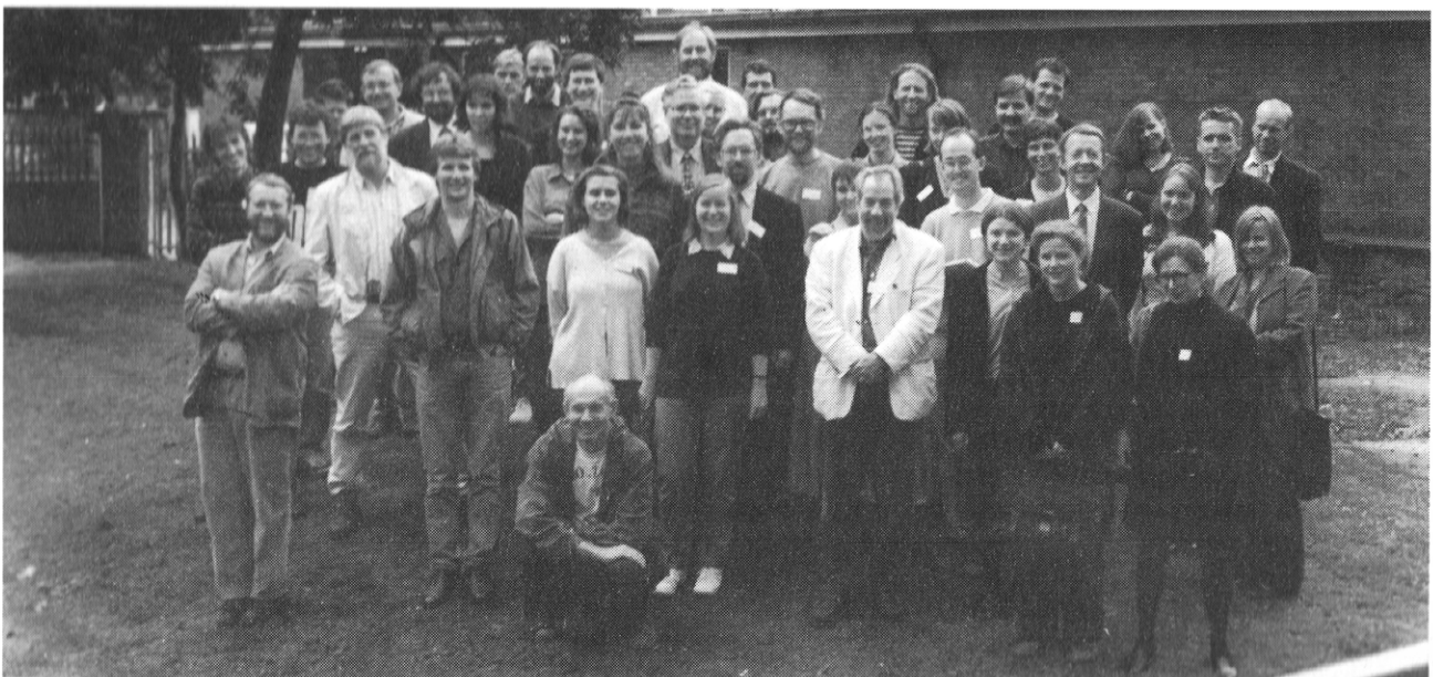
Still smiling after 20 years. BCG members at Bolton

The next day an unsurprisingly quiet group reassembled to hear two