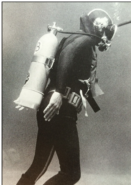
Fig 2. The first Natural History Museum SCUBA dive team was setup in the 1960s, here diving at the 35m Siboglinum fiordicum depths in the early 1970s. Early observations of living siboglinids were an important clue in understanding their evolutionary history.