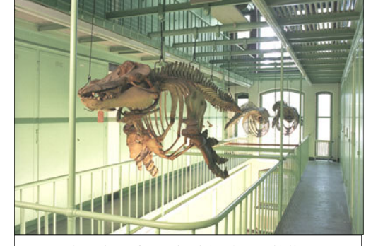
The view from inside the building

exhibitions. Climate control of the collection building improved very significantly. While we had many problems with the control of humidity and temperature in the Raamsteeg building, the new building is designed for climate control with minimum use of energy. Also, an advanced security system prevents uninvited visitors to enter. The collection tower of 20 floors has no windows, the walls are made of 60 cm concrete, with insulation outside and a characteristic cover of steel. Temperature is