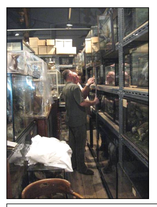
Fig. 4. Choosing Murray Cases in the Natural History Store during July 2009.

During this research into the collection it became apparent that Kendal Museum houses a unique collection of the taxidermy of Henry Murray & Son who lived and worked in Carnforth, near Kendal, arguably the finest in the U.K. and a real jewel in the history of Kendal Town. We decided to publish a second, more detailed book on this collection. Another period of intense photography followed (Figs. 4-5) and six months later, a second volume was published, illustrating the superb quality of the work by H. Murray & Son (Fig. 6). The book also included a fascinating historical introduction to Kendal Museum, which puts into context the collection as it exists today.