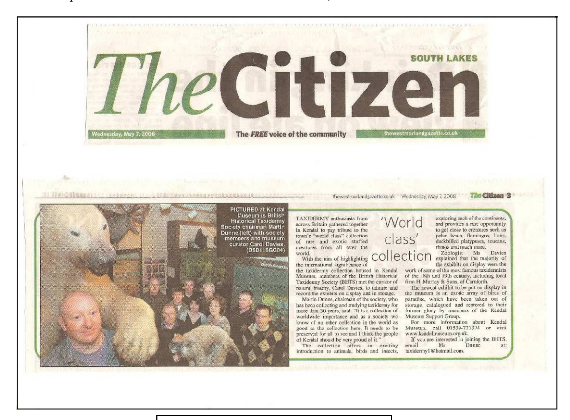
Fig. 1. Kendal's world class collection in the news.

In 2008 I was delighted to host the U.K. Guild of Taxidermists conference at Kendal Museum. This served to bring together some of the leading taxidermists working today and to enable members to examine unparalleled examples of the work of known Victorian taxidermists, held in the Museum collection. It was at this