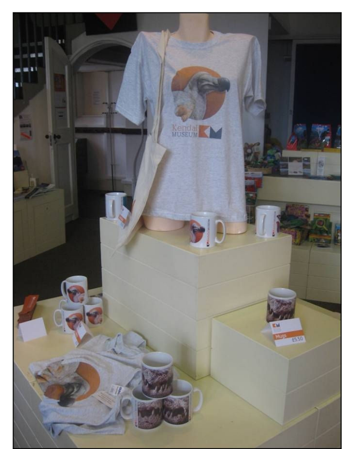
Fig. 10. The museum shop merchandise, including the Dodo T-shirt!