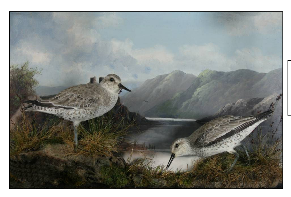
Fig. 8. An example from a series of post cards produced by the BHTS for sale at the Museum.

The second book was launched at Kendal museum on Oct 23<sup>rd</sup> 2009 – The event was attended by taxider-mists and local natural history and wildlife enthusiasts, as well as local dignitaries and residents. Kendal Museum was delighted to welcome the researchers from the BHTS who had compiled the book over a period of 3 years (Fig. 7). Pat Morris gave a highly entertaining illustration of the changing attitudes to taxidermy and Carl Church, leading bird taxidermist, brought a Dodo model! To capitalise on the publicity of the project, BHTS prepared a series of post cards for sale at the Museum (Fig. 8).