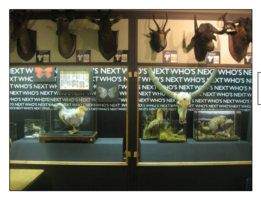
Fig. 9. Display during preparation, February 2011

The Dodo rather stole the show and Kendal College with foresight bought it for the Museum thus generating the next project, WHO'S NEXT, a new education program at Kendal Museum generously supported by Renaissance North west. The recently acquired Dodo will form the iconic centerpiece of a new gallery display featuring extinct and endangered species represented in the magnificent collections (Fig. 9) (see Fig. 11 overleaf for image of panel of extinct and endangered birds and animals in Kendal Museum). To support this display there are a number of educational projects, ranging from Key Stage 1 through to college students in training and education. The Dodo was also featured on a promotional T-shirt available for sale in the Museum's shop (Fig. 10).