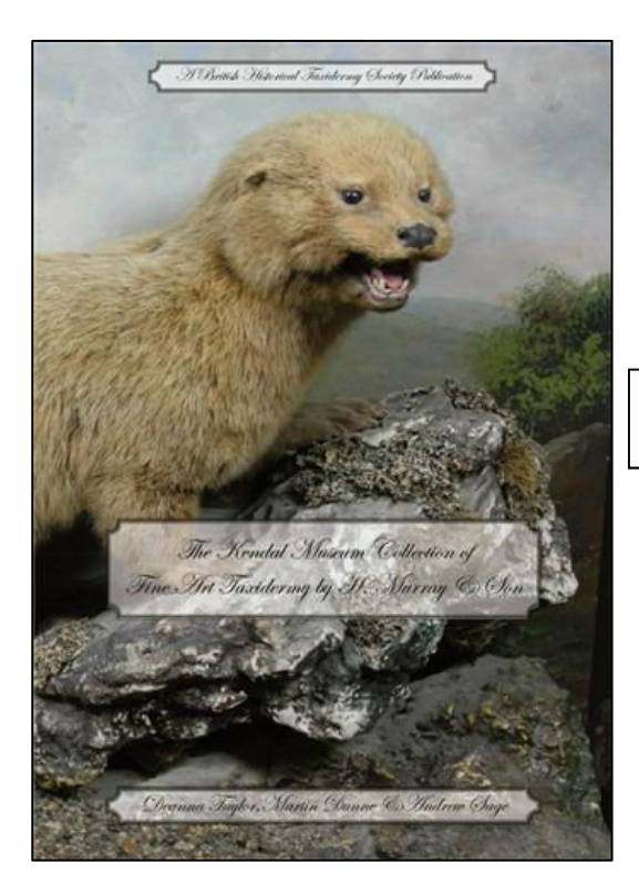
\begin{tabular}{ll} Fig. 6. The cover of the second book: The Kendal Museum Collection of Fine Art Taxidermy by H. Murray & Son. \\ \end{tabular}