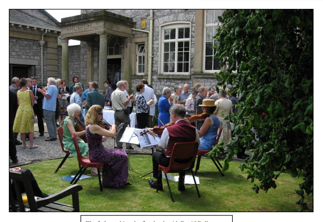
Fig. 3. Launching the first book with David Bellamy.