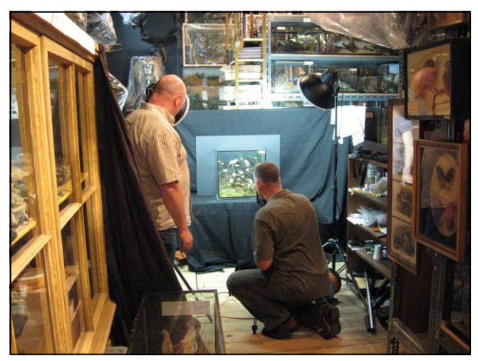
{\bf Fig.~5.} Photography of the Murray cases in the Natural History Store during July 2009.