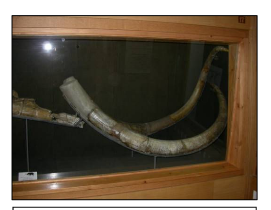
Permanent Palaeontology Display