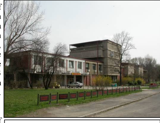
Macedonian Museum of Natural History

The Natural History displays are of good quality, even if a bit traditional, but it was interesting to see how they