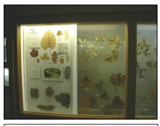
Permanent Botany Display